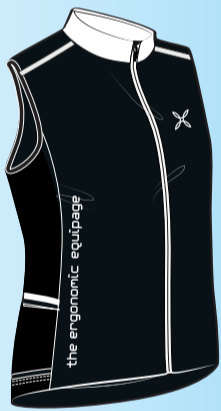
MCAI00X / W QUARZO FULL ZIP CANOTTA / W.